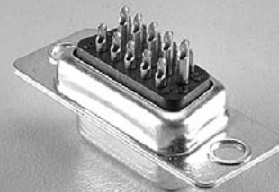
DSH - E15 P - X - 000 ◀ EXAMPLE