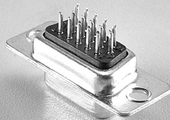
DDH - E15SB - X - 000 ◀ EXAMPLE